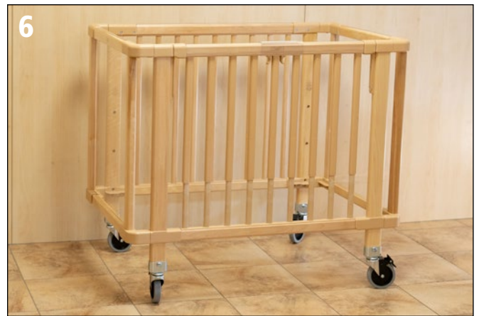
Before adding mattress support, check that all corners are fully latched.