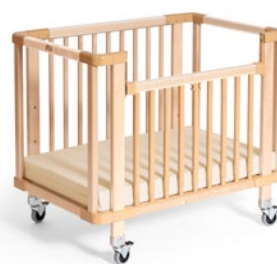
G304 BackSafe Cot