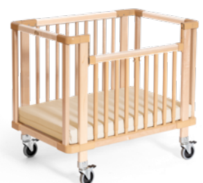
G309 BackSafe Evacuation Cot