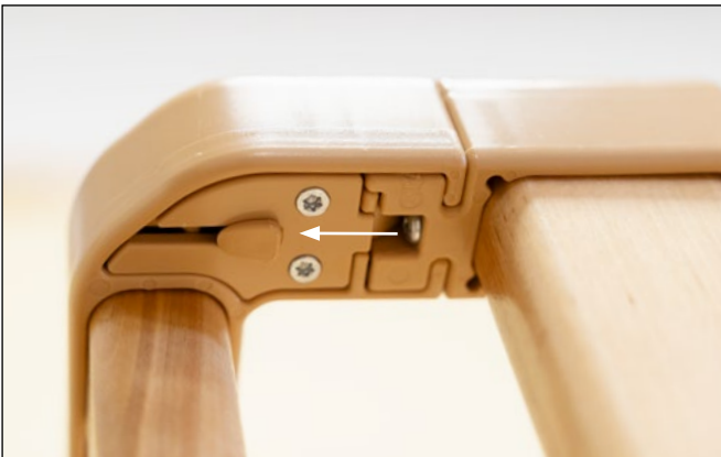
Spring-loaded latches under corners (bottom view).