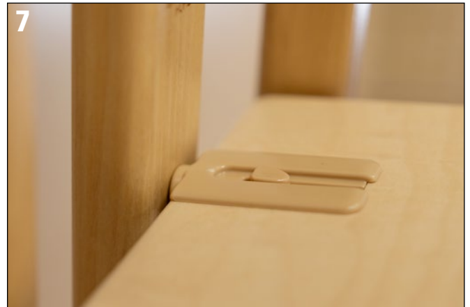
Add mattress support board. Latches click into holes in cot sides.