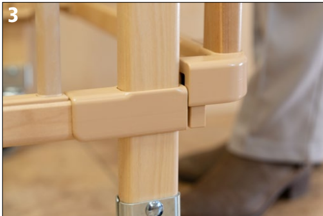
Attach the second side to the cot end with the ledges for the mattress support board facing inwards as shown above.