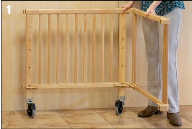
Assemble first two parts as shown. Top and bottom latches should click.