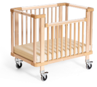
G304 BackSafe Cot