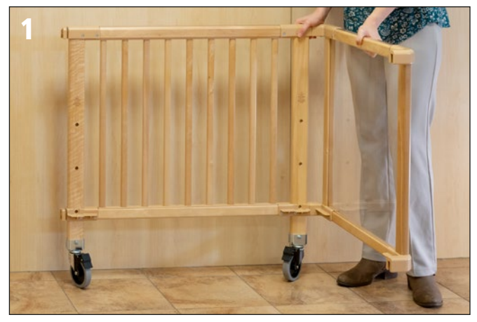
Assemble first two parts as shown. Top and bottom latches should click.

If your shipment is incomplete, please call customer service. All packaging is recyclable (cardboard and LDPE). Please recycle in accordance with local guidelines.