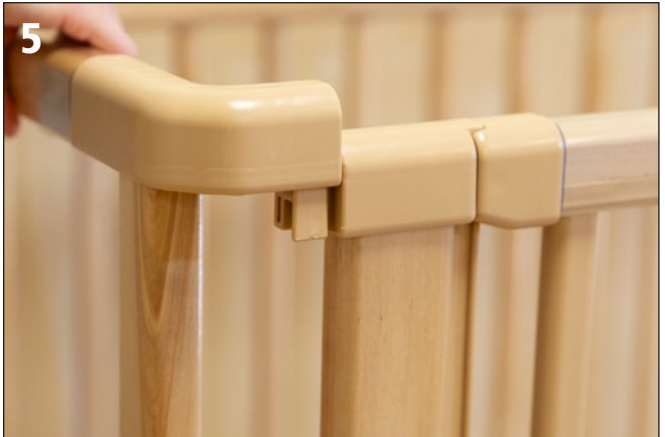
Install second cot end. Top and bottom latches on both corners should click.