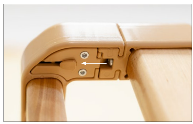
Spring-loaded latches under corners (bottom view).