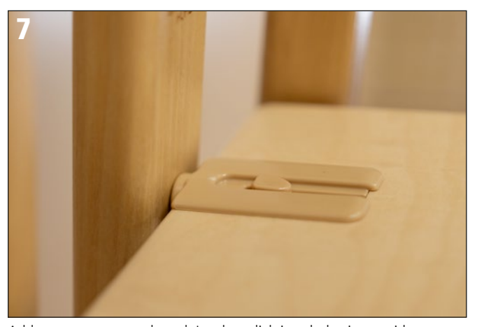
Add mattress support board. Latches click into holes in cot sides.