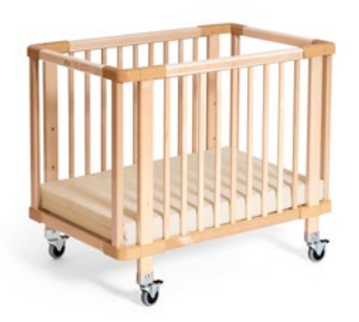
G307 Evacuation Cot

IN ADVANCE... decide where the cots will be set after evacuation from the building. Select a level area which will be out of the way of emergency responders.