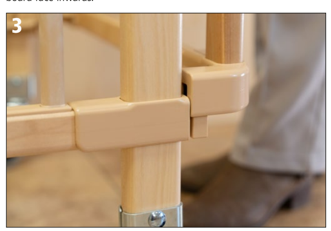
Attach the second side to the cot end with the ledges for the mattress support board facing inwards as shown above.