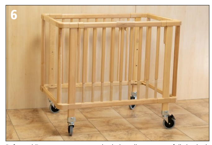
Before adding mattress support, check that all corners are fully latched.